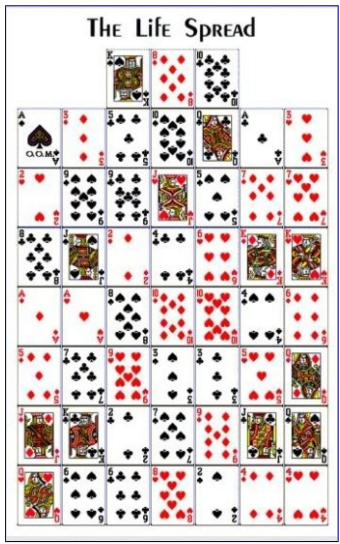
Destiny Cards Life Spread

With all of the cards in the deck to choose from, which card is yours? It all depends on the day of your birth. <u>Go here</u> to look up what your birth card is. Once you find your birth card, you can find yourself in the Life Spread, shown below.